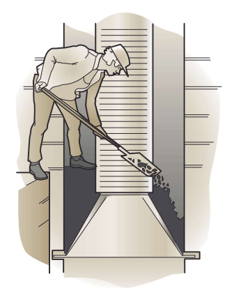
5. Cement the cone into place and lay 5-10cm of mortar over the joint between the liner and the