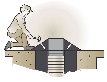
8. Brick up and seal the work hole.