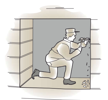
1. Hack out a work hole that is sufficiently large to insert the bottom cone just above the connector pipe.

Dimensioning: Each individual unit should be considered for type of operation and capacity. Prior to installation, check that the liner will fit the entire length of the chimney flue by pulling through a draw plug with the relevant size of pipe attached.