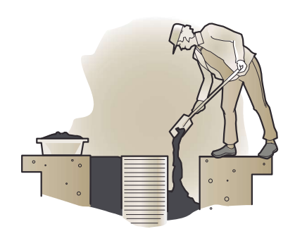
7. Fill the space between the chimney and liner with chimney insulation (Vermiculite, see page 25).