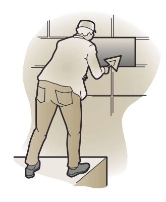
6. Brick up and seal the work hole.