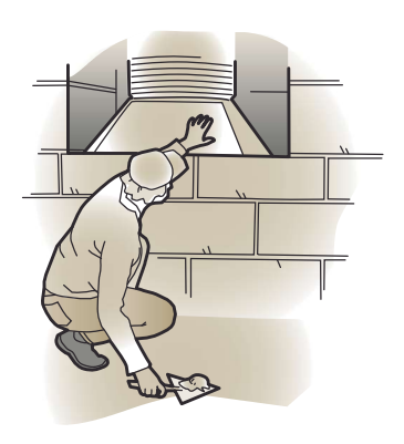
Assemble the bottom cone and the liner, secure using acid resistant pop rivets.