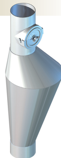
Asymmetrical RSAR60 with inspection hatch